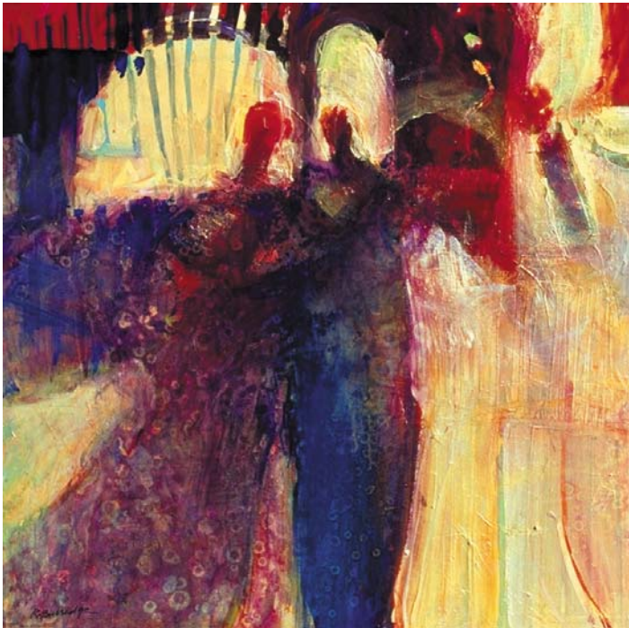
Winged Messenger, 36" x 36", mixed media on canvas

An Exhibit of Paintings in Homage to Myths of the Storytellers.