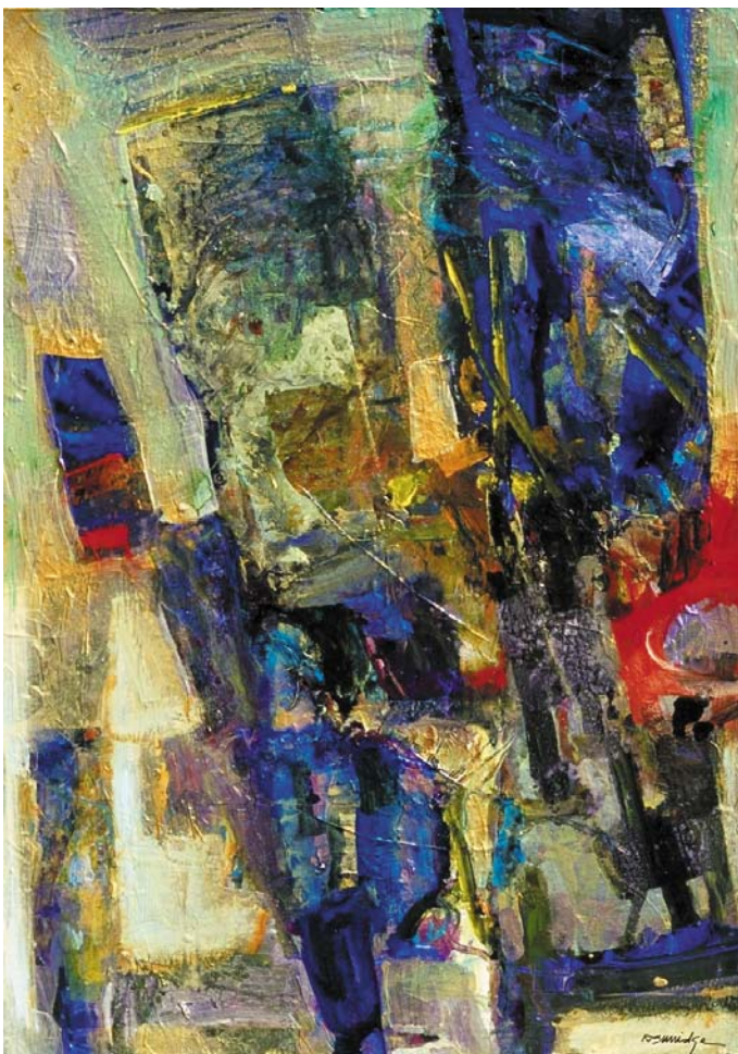
Creation of First Man, First Woman, 30" x 40", mixed media on paper

This show visually explores my ideas of language, ancient beliefs and hope.